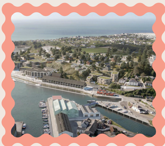
CGI in relation to planning permissions

As one of Cornwall's largest long-term regeneration projects, we want to keep you up to date with progress. Read on for the latest updates, and don't forget to visit our website and sign up for our regular e-newsletter.